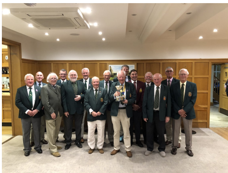
The Winning Hertfordshire Team