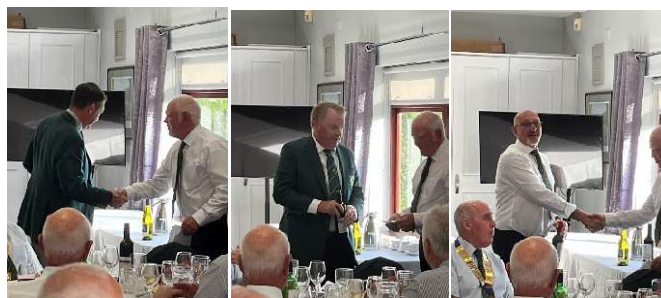
Nearest the Pin Winners